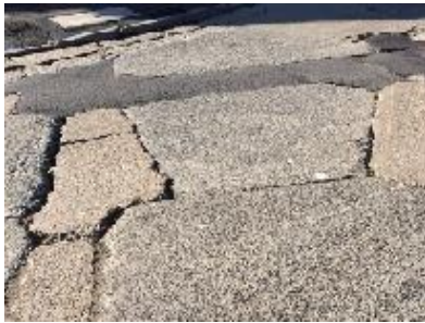
The worst section – the junction with Marbles Way

We have been pushing for improvements to parking in the Preston area, and to deal with the extra traffic created by the new developments. Plans for Chetwode Road have been out to public consultation, and have now been approved by the County. The scheme includes verge hardening to allow extra parking and re-alignment of the pavements. Many stretches of the road and pavement are to be resurfaced, with dropped kerbs and tactile paving extended. The bus shelters which are well past their sell-by date will be refurbished or replaced.